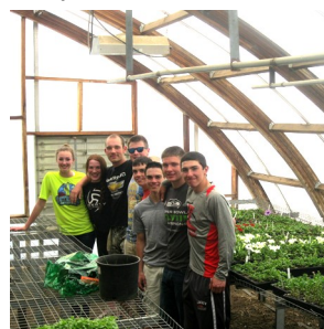
FFA plant sale May 11-12 7:30-5:00